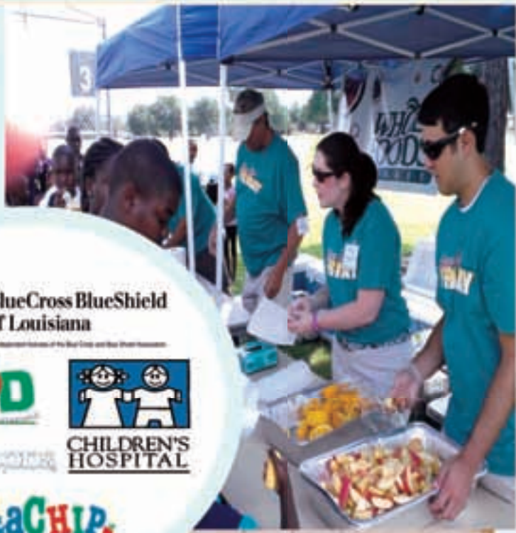
Mary Queen of Vietnam