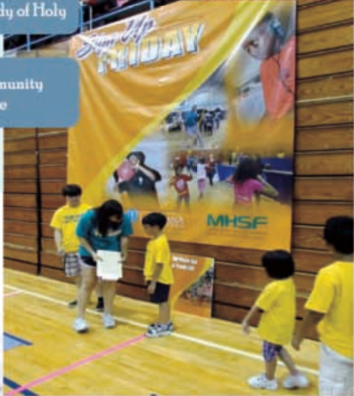
Nunez Community College