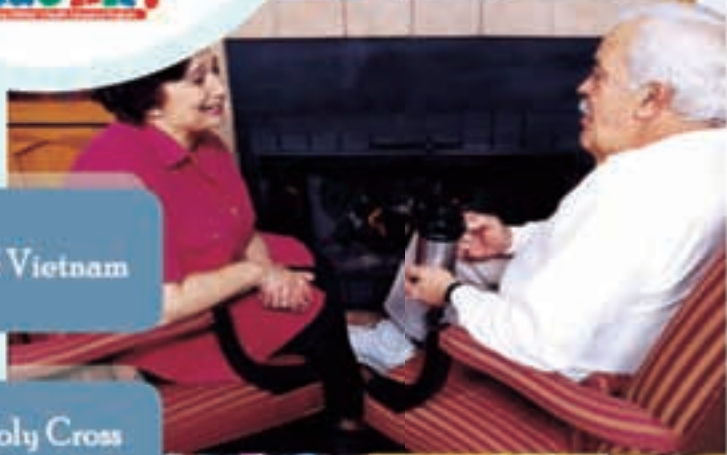
Our Lady of Holy Cross College Our Lady of Holy